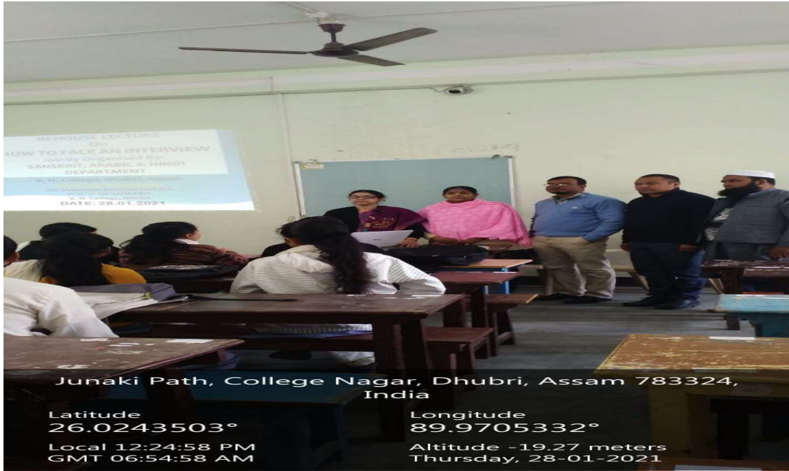
Faculty members of Sanskrit, Arabic & Hindi Departments