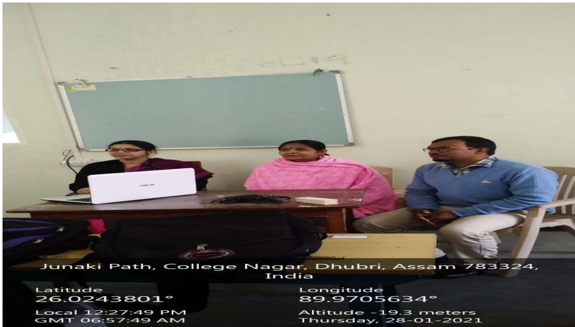
H.O.D.s of Sanskrit, Hindi & Arabic on the dais